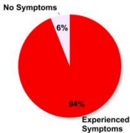
PTSD SYMPTOMS - 2 WEEKS AFTER ASSAULT